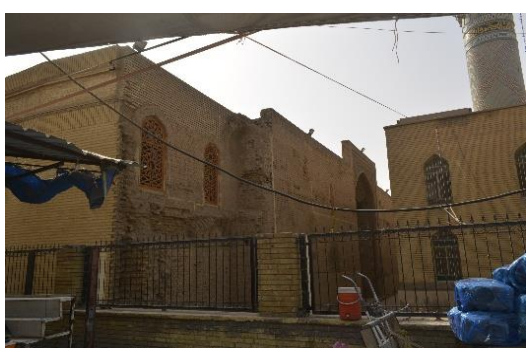
Figure (7): Mustansiriya missing parts (Authors, 2018)