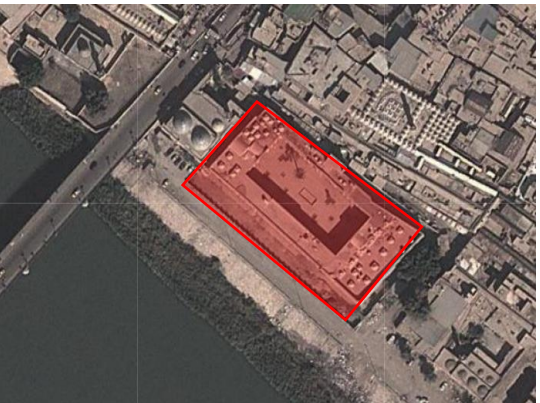
Figure (1): Mustansiriya Madrassa location. (https://virtualglobetrotting.com/map/mustansiriya-madrasah/view/google/)

It is situated on the eastern bank of the Tigris, near Rashid Street, and the Shuhada' Bridge, close-by structures incorporated the Saray souq, the Baghdadi Gallery, Mutanabbi Road, the Abbasid Royal residence and Caliph's Road. [23]. This was the focal point of the historic urban fabric, where the spines coming from the eastern gates of Bab al-Thalassa and Bab al-Wastani converged. It was accessible from the Tigris, which functioned as the main transportation axis of the city, from where a pontoon bridge provided a direct connection with the al-Karkh quarter on the other side of the river. [24]