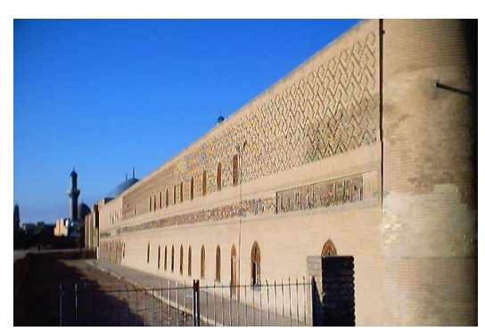
Figure (10): Mustansiriya river elevation