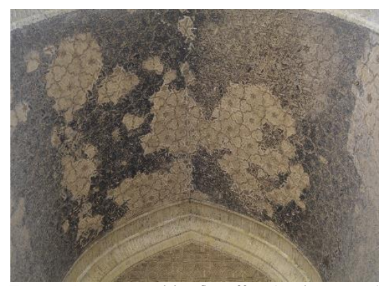
Figure (12): Mustansiriya fire effect (Authors, 2018)