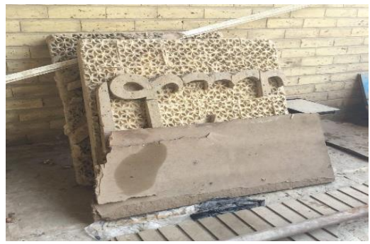
Figure (9): Mustansiriya restoration (Authors, 2018)