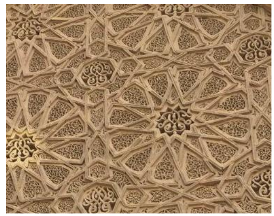
Figure (5): Mustansiriya ornaments (Authors, 2018)