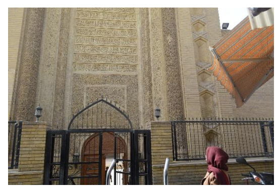
Figure (6): Mustansiriya entrance (Authors, 2018)