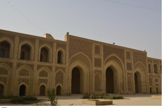
Figure (4): Mustansiriya arches pattern (Authors, 2018)