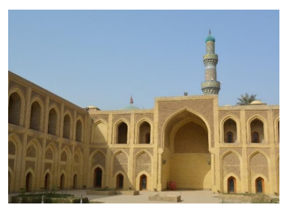
Figure (2): Mustansiriya Madrassa courtyard

All around the courtyard and the upper storey are rooms for different usages. Those in the upper storey could be student's dwellings'-rooms. The decoration is completely modern, but mostly according to the previous patterns of which were found some remains before the restoration works began. [23]. Figure 2-3.