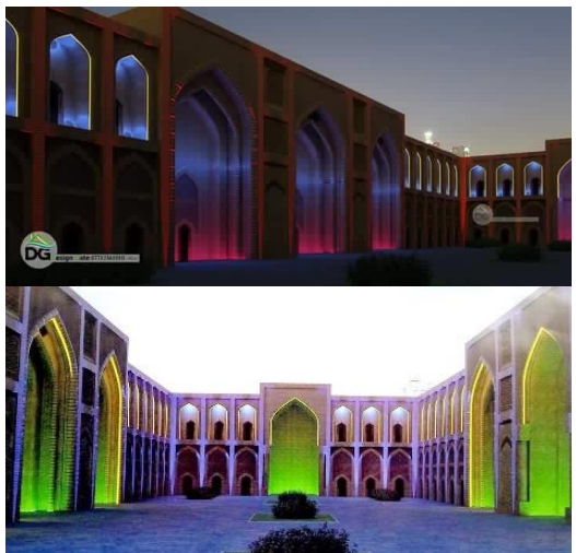
Figure (8): Mustansiriya light technology