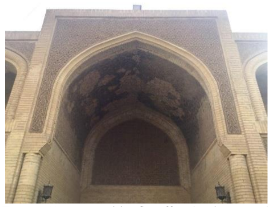
Figure (11): Mustansiriya fire effect (Authors, 2018)