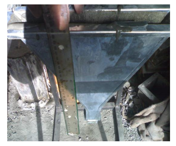
Figure 2: Viscosity and fillingability by V-funnel flow time test

indicate greater flowability. For self compacting mortar a flow time of between (7-11) seconds is considered appropriate <sup>(6)</sup>. see Figure (2)