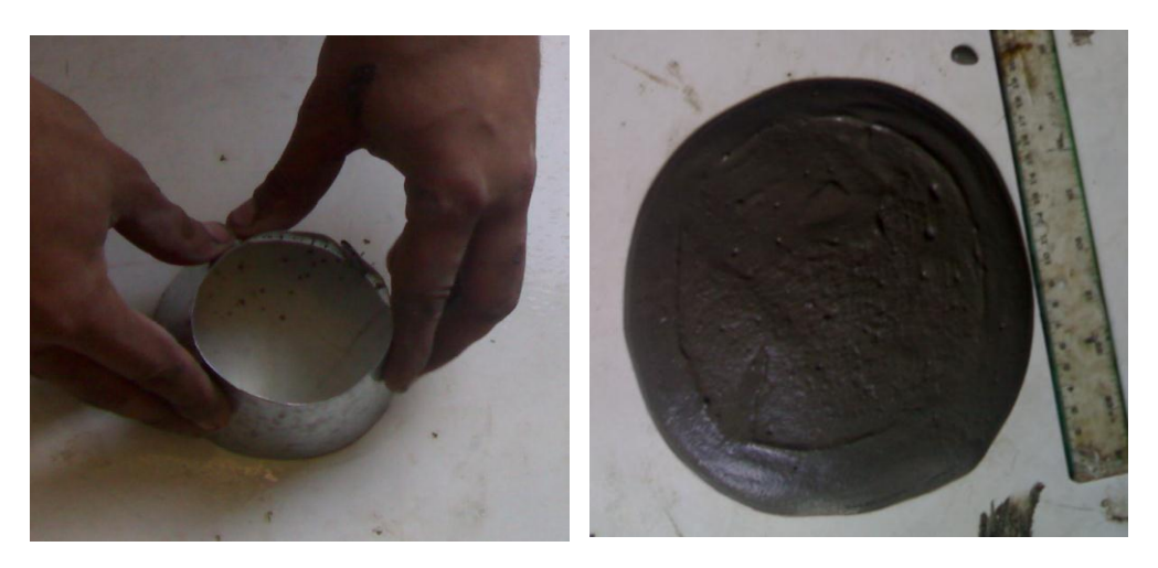
Figure 1: Consistency test by Flow Table