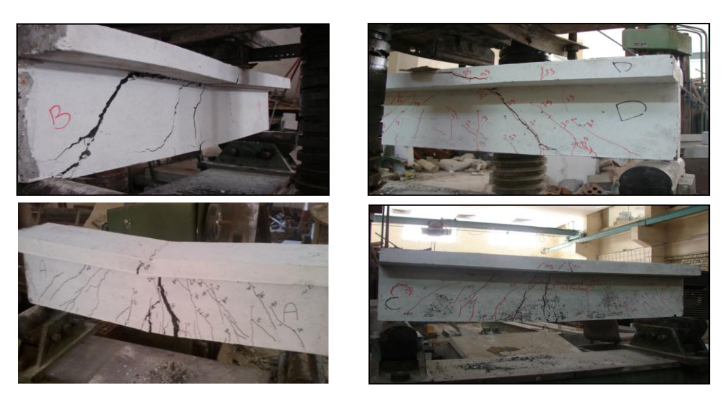
Figure 5:Crack Patterns for T-Beams