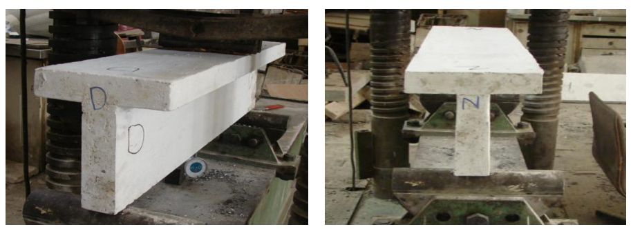
Figure 4: Setup of Tested Beams