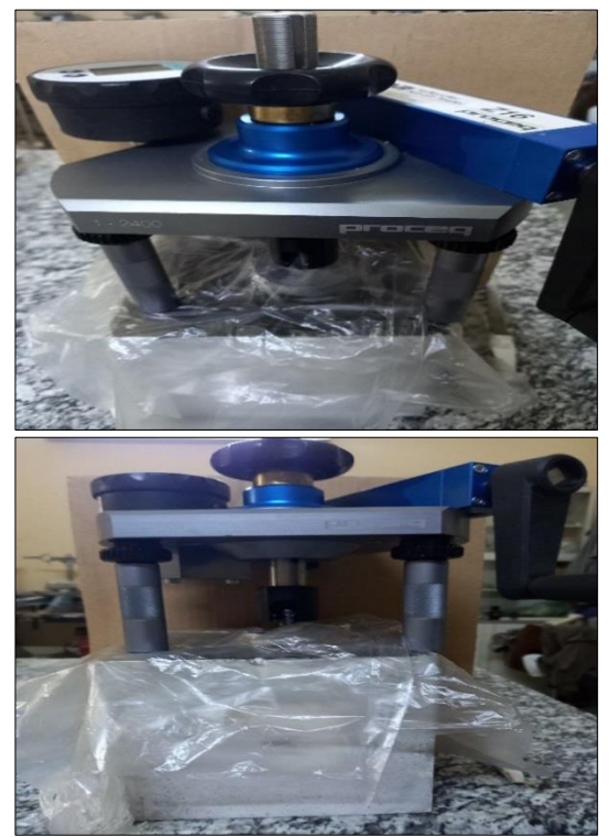
Figure (1): The Pull-off test