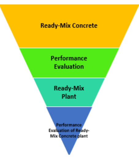
Figure (5): Review process