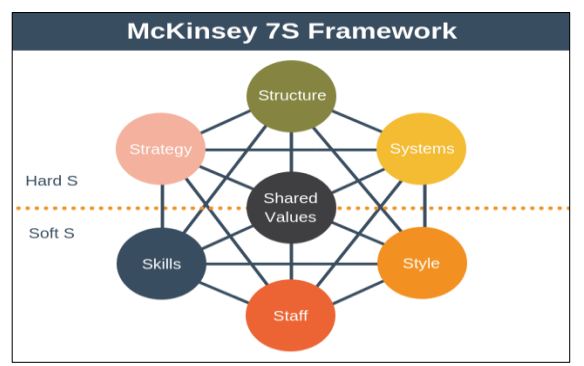
Figure (3): McKinsey 7S model

The diagram consists of two parts. Structure, strategy, and a system constitute the "difficult" portion. The structure is a representation of the organizational responsibilities and position. This model is frequently used to describe hierarchies, permissions, responsibilities, and roles. The systems (procedures) are the processes within an organization that manage, coordinate and direct the promotion and transfer of people to meet the organization's objectives. A strategy is an organization's operations to accomplish its goals and objectives [43]. Other components make up the soft portion of the model. 'Skills' is defined as the sum of the individual capabilities of each employee in an organization;' staff' are people employed by the organization with varying knowledge and experience, intelligence, ability, and training;' style' is a method of allocating rights and responsibilities within an organization; and shared values are the beliefs, expectations, and attitudes regarding Work, organization, and acceptable behaviour shared by the majority of employees, as well as any communicable beliefs. The 'hard' elements pertain to the organization's technical characteristics, while the soft elements represent its social side.