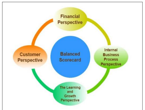
Figure (2): Balanced Scorecard

The Balanced Scorecard is a strategic performance management framework developed by Robert Kaplan and David Norton in the early 1990s. It provides organizations with a comprehensive view of their performance by measuring and tracking key indicators across four perspectives: financial, customer, internal processes, as shown in Fig.2. and learning and growth; it recognizes the importance of non-financial measures in assessing organizational performance and incorporates them into the evaluation process [37]. The financial perspective focuses on financial indicators, while the customer perspective looks at customer satisfaction and loyalty. The internal processes perspective assesses the efficiency and quality of internal operations, and the learning and growth perspective emphasizes employee development and innovation. By translating strategy into key performance indicators for each perspective, organizations can monitor progress, identify areas for improvement, and align actions with strategic objectives [38]. The Balanced Scorecard provides a balanced and holistic approach to performance management, considering financial and non-financial aspects to achieve long-term success [39].